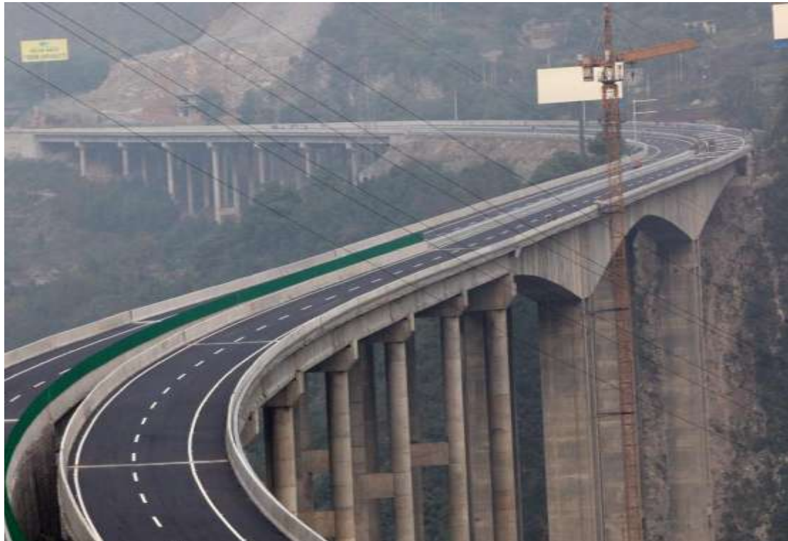
Figure 5 Wansheng bridge completion photos