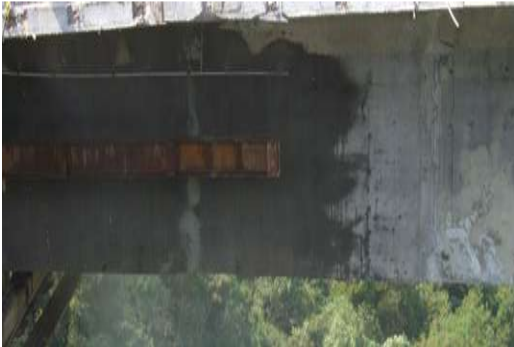
Figure 3 Lateral maintenance web rendering