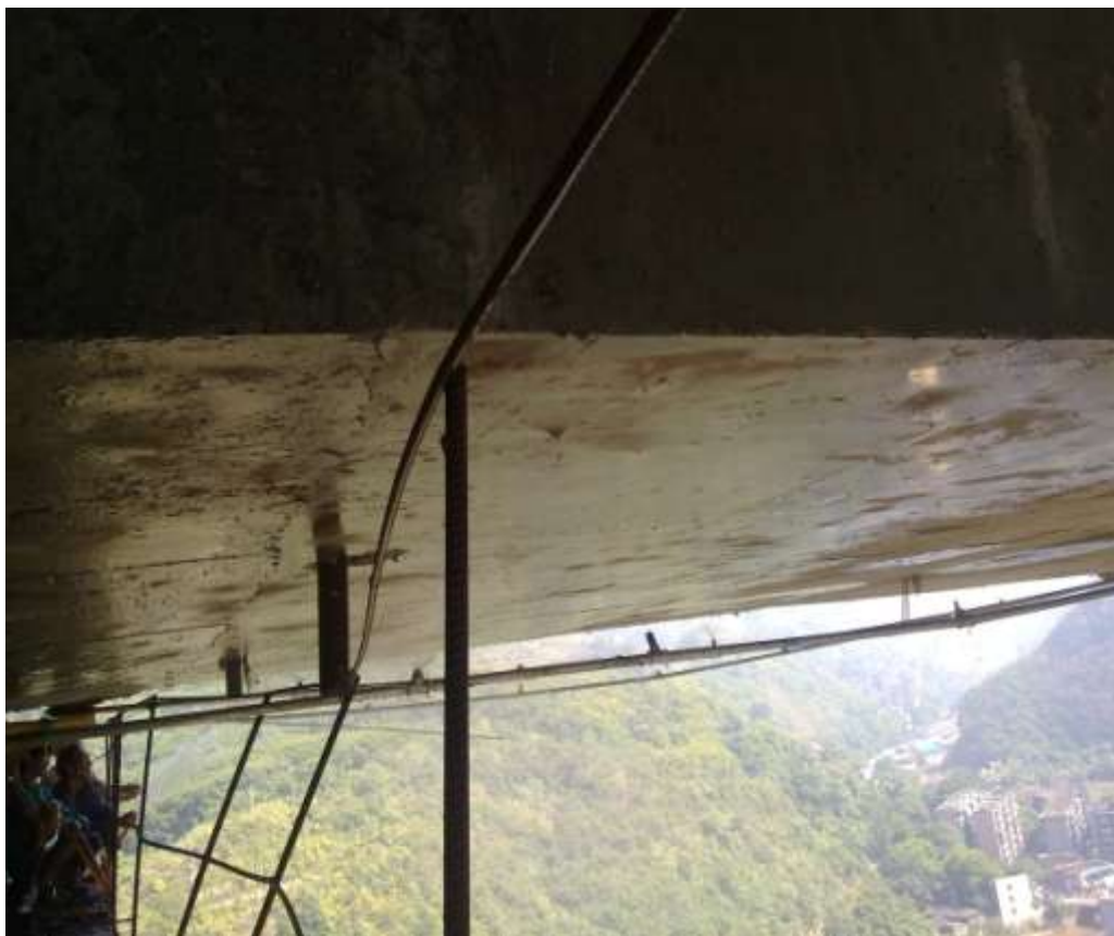
Figure 4 Floor maintenance effect