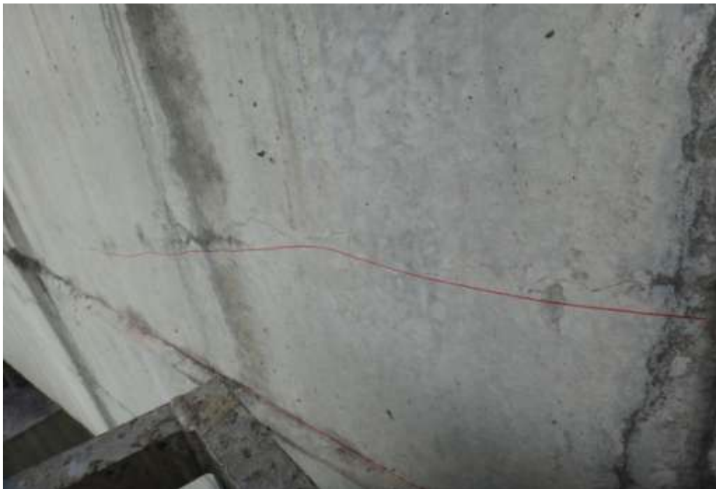
Figure 2 Bridge girder crack figure without adopting the maintenance method

Wansheng super major bridge in chongqing wansheng WanDong Town new tamura dam, for chongqing to the nanchuan wansheng A1 contract section of freeway. Continuous rigid frame box by the single single room section, C55 concrete, three-way prestressed, 6.8 m wide, at the bottom of the wing plate cantilever 2.6 m, 12 m in full width. Box girder root 10 m tall, and across the high end of 3.5 m, the construction method of cantilever construction of hanging basket. Box girder cantilever construction stage of the "automatic water spray mist stick + artificial +" composite curing method, compared with Bridges without adopting the curing method, greatly reduce the cracks of the box girder web plate and bottom, rendering shown in figure 2 ~ 4. In terms of quality and efficiency of a superior departments owners and consistent affirmation, achieved good effect. Wansheng super-large bridge completion figure as shown in figure 5.